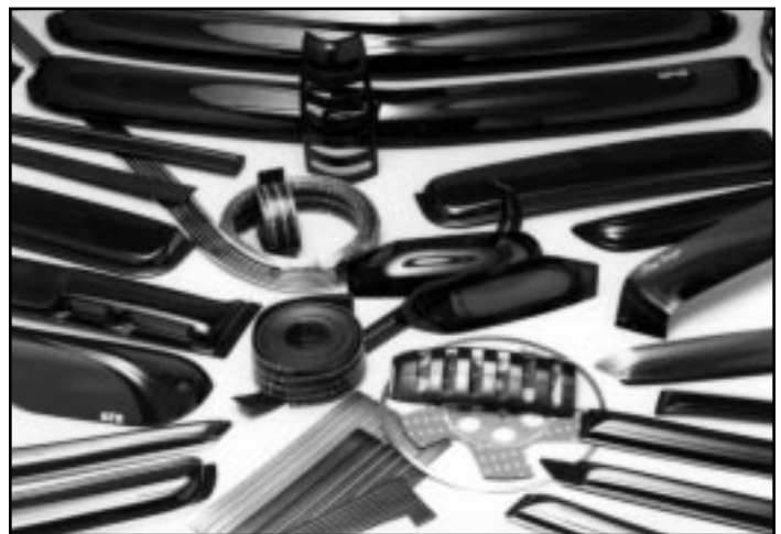
A wide range of aftermarket trim accessories enjoy the benefits of adhesive fastening.

3M faces many challenges in tape development. One such challenge relates to the evolving paints, waxes and plastics used in automobile manufacturing. New materials require that 3M continue to make parallel advancements in the construction of