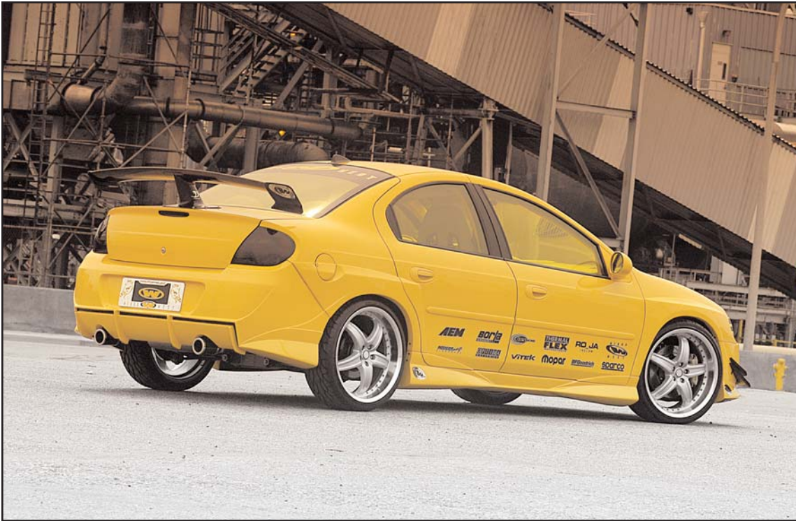
Wings West's Protégé project vehicle incorporates a body kit, flares and louvers attached with Acrylic Plus Tape from 3M.