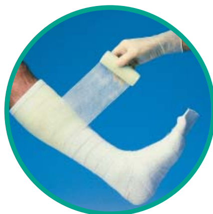
Quick and easy to apply